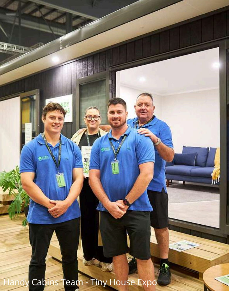
Handy Cabins Team - Tiny House Expo