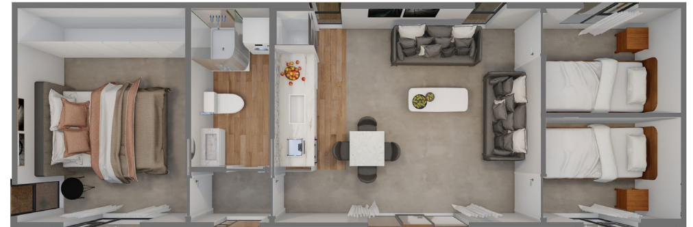
Pukeko | Three Bedroom