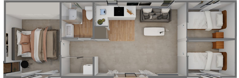
Pukeko | Three Bedroom, Separate Laundry